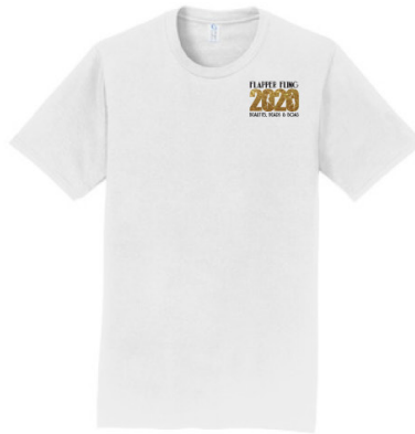
PC450 Adult Fan Favorite White Tee w/ Gold & Black 2020 Workshop Logo