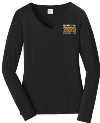
LPC450VLS Ladies Long Sleeve Fan Favorite Black Tee w/ Gold & White 2020 Workshop Logo