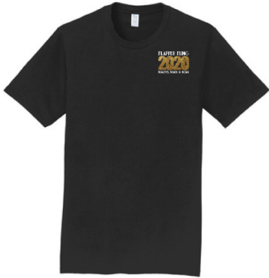
PC450 Adult Fan Favorite Black Tee w/ Gold & White 2020 Workshop Logo