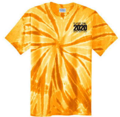
PC147 Adult Fan Favorite Gold Tie-Dye Tee w/ Black 2020 Workshop Logo