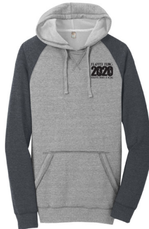
DT196 Lightweight Fleece Raglan Hoodie Heathered Grey & Charcoal Hoodie w/ Black 2020 Workshop Logo